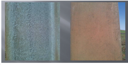
Surface Condition Aged Galvanized Steel Rating R-1 & R-2